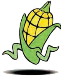
Non GMO Corn Available

In this age of GM Traited Seed corn, we find several of the major seed corn companies promoting their GM Traits over good old-fashioned genetics. Giant Seed Company, on the other hand believes that the good old-fashioned selection and back crossing of new parent lines remains in the best interest of the American Farmer. It's their assurance of having strong high yielding seed corn hybrids for now and future generations of Farmers.